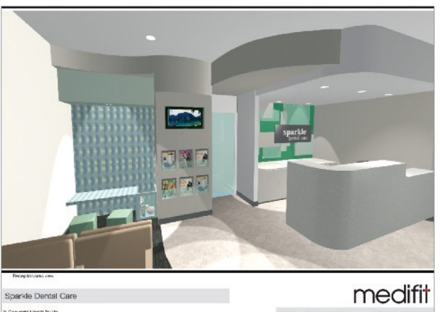
3D rendering developed in the design phase.

simple extension and refurbishment, the building now required considerable reconstruction and site drainage work.