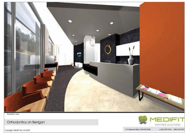
3D rendering developed in the design phase

achieve this, we engaged Levitch to develop the practice brand as a first step. Their scope included developing the practice name, a tag line, colour scheme, style guide, stationery suite and advertising materials. Once we had a brand, we could begin work with Medifit on the practice fit-out design."