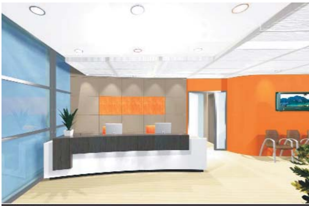
entry and reception view