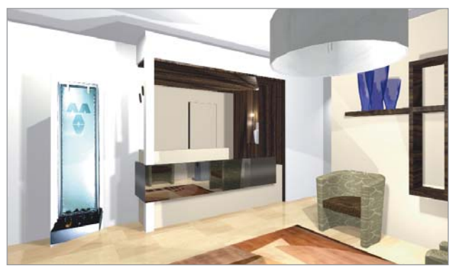
3D rendering developed in the design phase.

Colin Priestland, suggested I contact Medifit as they had a very good reputation in Queensland with very positive feedback from the dentists concerned. They all stated that the quality was excellent and that they offered a very professional service.