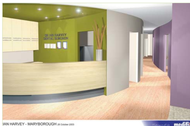
Above: 3D CAD drawing prior to construction.